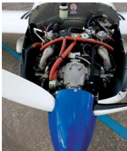
The 80-hp Rotax 912 engine is the standard powerplant for the Breezer, with the 100-hp 912S an option. With room to spare in the engine compartment, engine overheating was not a problem.

A hand brake will also be mounted on the joystick, he said. Because the Breezer uses hydraulic brakes, hand levers afford sufficient authority. The Breezer I flew had a centrally mounted