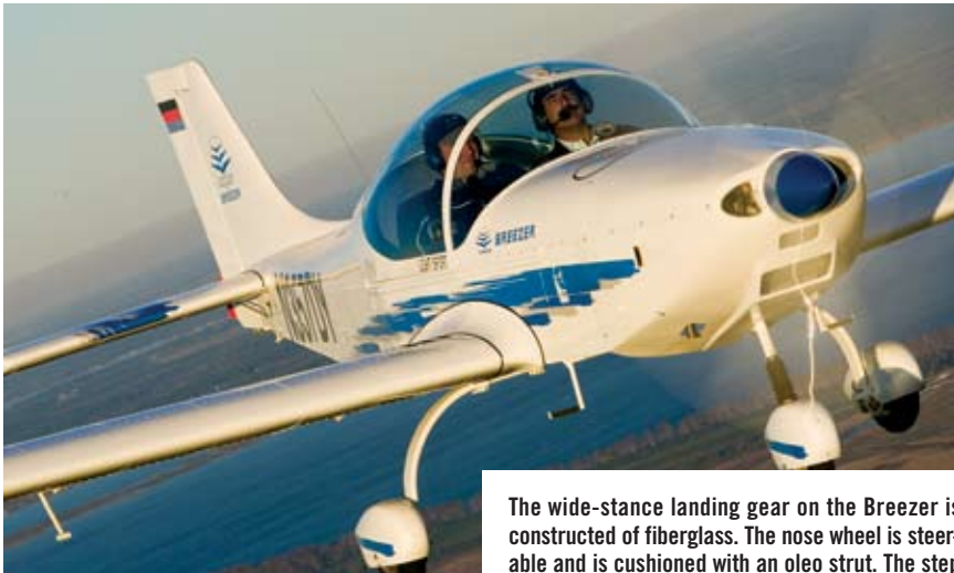
The wide-stance landing gear on the Breezer is constructed of fiberglass. The nose wheel is steerable and is cushioned with an oleo strut. The step for entering the aircraft from the front of the wing is obvious in this photo.

windscreen is a handy support. With an aft-sliding canopy, the design made sense right away.